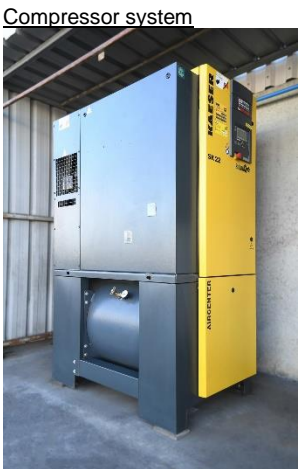
019_Image 1_compressed air at Trucks and Trailers.jpg

Caption: The all-in-one Kaeser Aircenter SK25 at Trucks & Trailers.