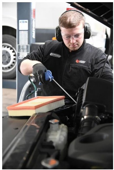
019_Image 4_compressed air being used at Trucks and Trailers.jpg