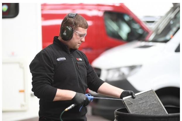
019_Image 3_compressed air being used at Trucks and Trailers.jpg