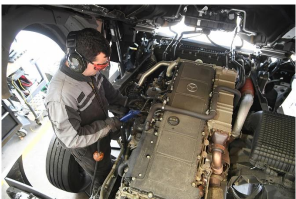
019_Image 8_compressed air being used at Trucks and Trailers.jpg

Caption: Compressed air is an essential utility to the vehicle workshops required for many purposes such as running the air tools to pumping up tyres.