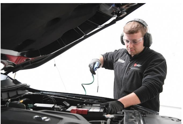
019_Image 5_compressed air being used at Trucks and Trailers.jpg