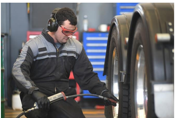
019_Image 6_compressed air being used at Trucks and Trailers.jpg