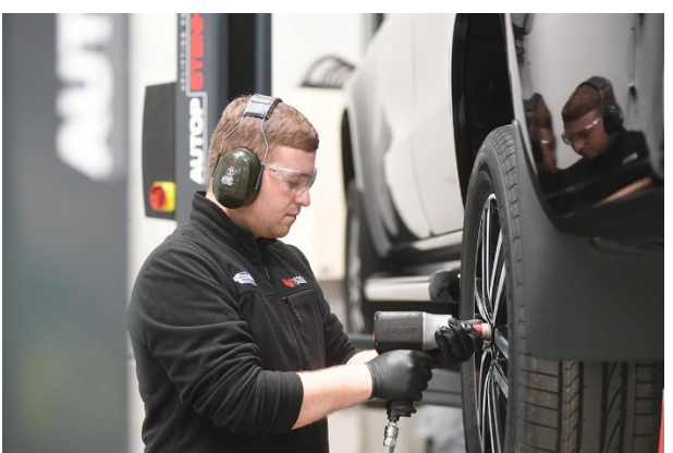
019_Image 2_compressed air being used at Trucks and Trailers.jpg