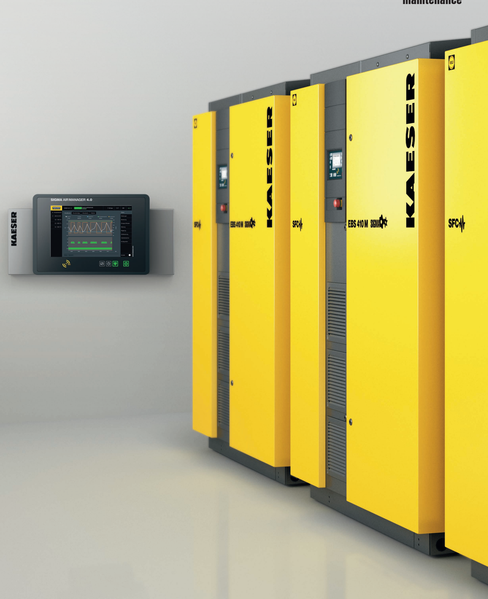
"KAESER 4.0 - real time adjustment and predictive maintenance"