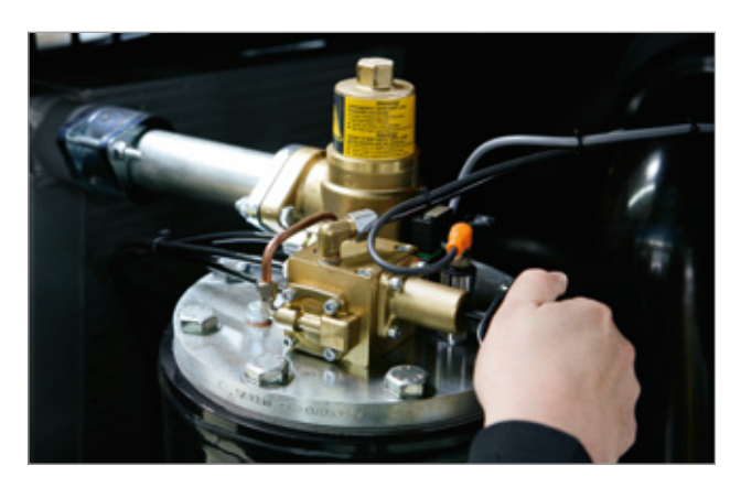
M 122: Proportional controller with manual wheel

On 10 to 14 bar versions, a manual wheel control fitted to the proportional controller enables infinite pressure adjustment for enhanced flexibility.