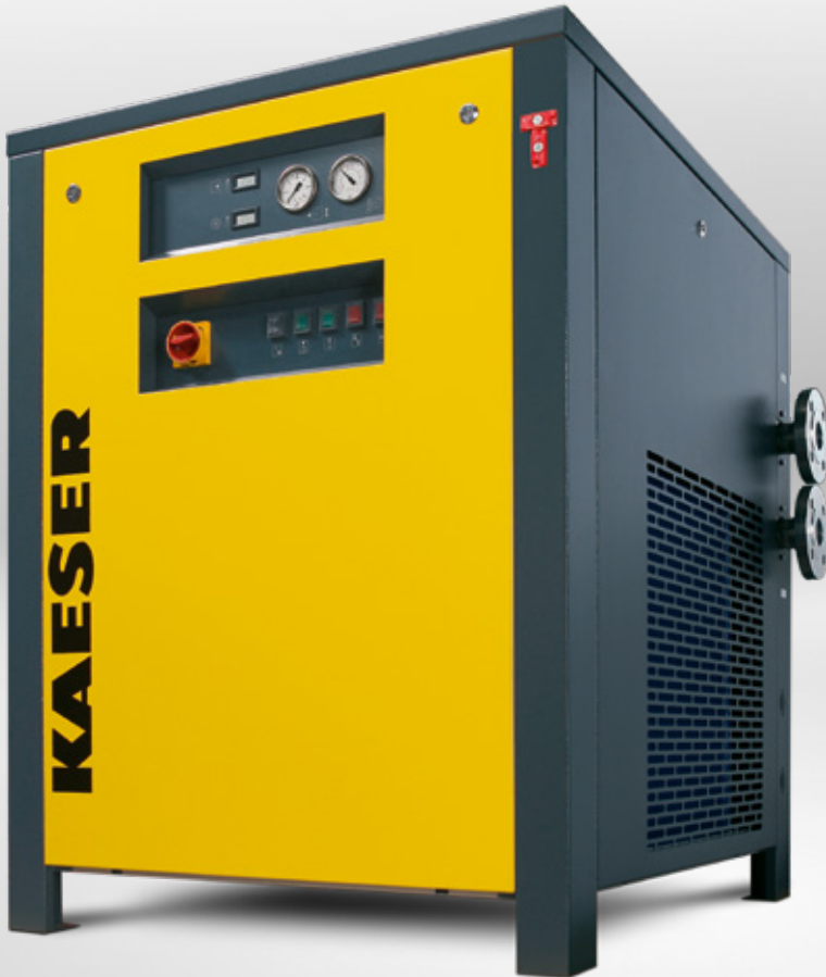
Standard version THP 40-50