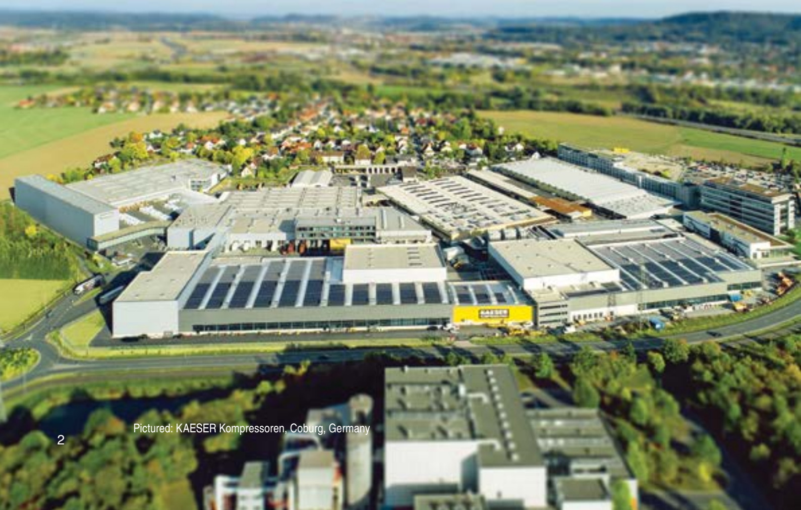
Pictured: KAESER Kompressoren, Coburg, Germany