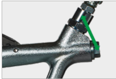
Male stud handle fitting