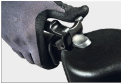
Ergonomic trigger lock