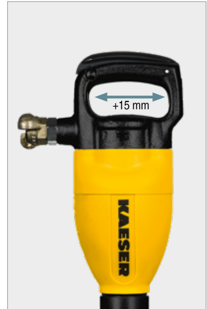
Wider grip aperture